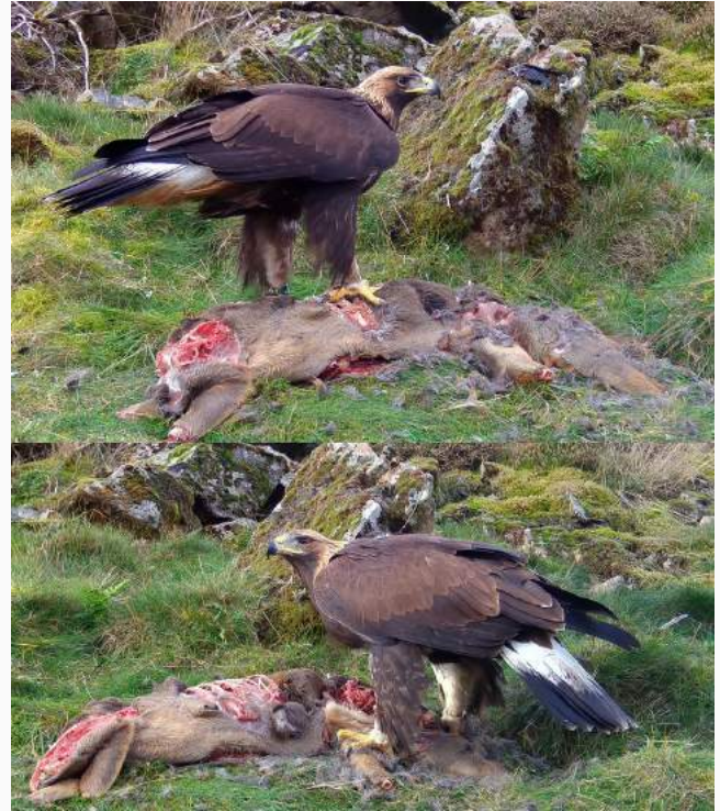
Photo of B44 C24 at supplementary food

The four 2018- 2019 translocated eagles (Beaky, Edward, Emily and Skan) are doing well and showing signs of settling on territory.