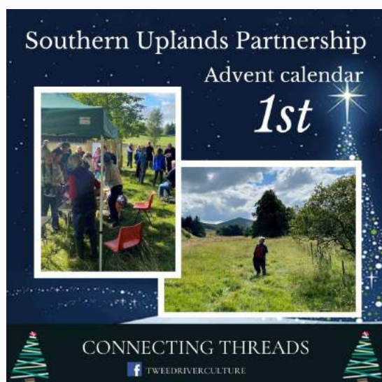
SUP Advent Calendar