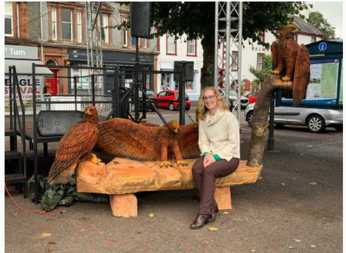
Image of Lorna Slater MSP on the new eagle bench carved by Sam Bowsher

Golden Eagle Species Champion and Scottish Government Minister for Green Skills, Circular Economy and Biodiversity, Lorna Slater MSP, supported the festival with a visit to the project and a weekend supporting the festival activities.