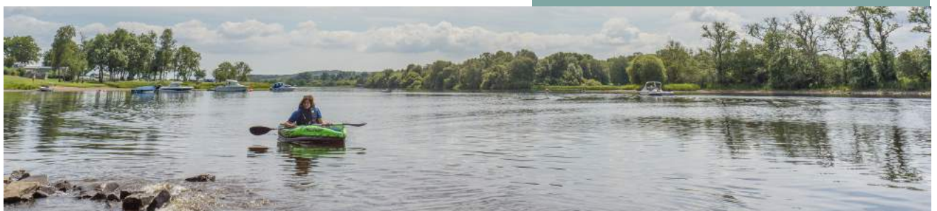
Loch Ken, Galloway