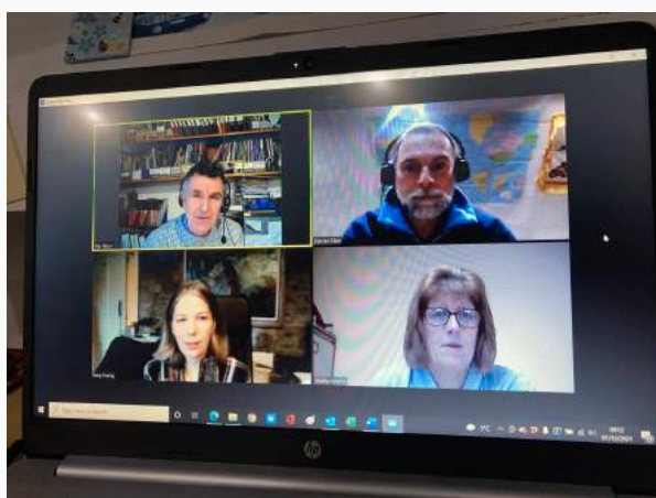
Team meetings continue to be via Zoom