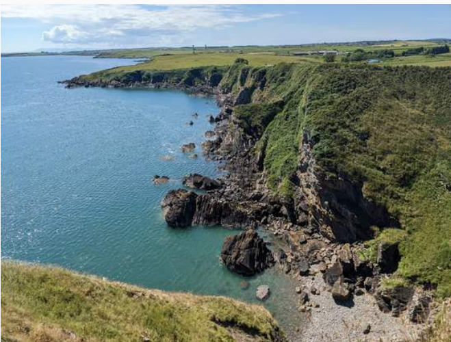
the Machars coastline between Garlieston and Isle of Whithorn