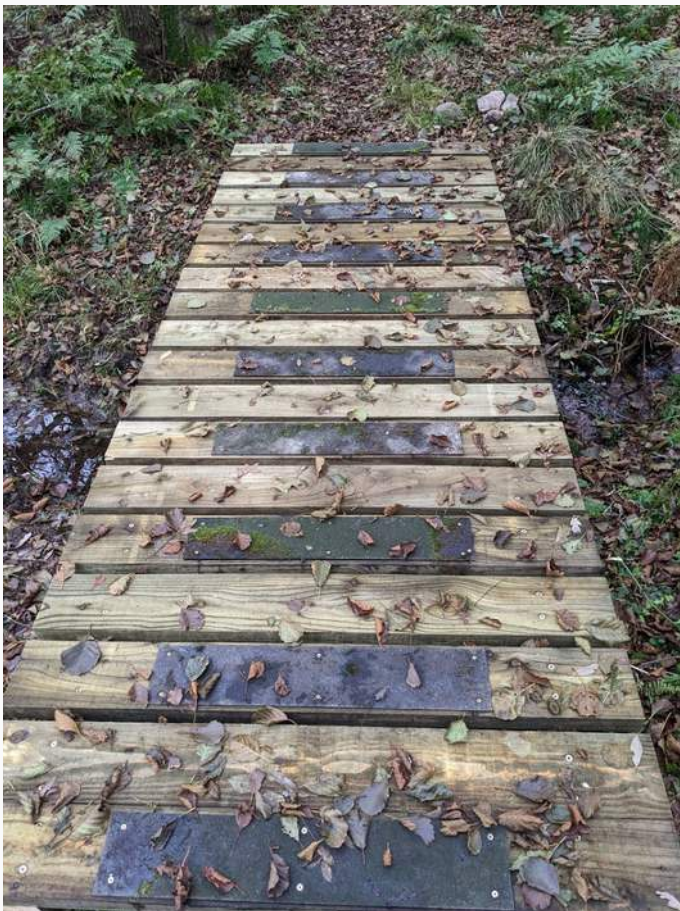
Boardwalk in woods at Airds Point (New Abbey)

Our South West Scotland Coastal Way Project has progressed capital improvements along coastal core paths in New Abbey, Dumfries and Annan. These works have included drainage improvements, replacing stiles with more accessible gates, boardwalk replacement and creating a crossing point over a tidal channel. The works are part of a route mapping exercise connected to our longer term ambition to create a long distance coastal walking route between Gretna and Stranraer. The project has seen SUP work closely in partnership with Dumfries and Galloway Council and has been made possible thanks to funding from the Council's Coastal Benefit Fund, The People's Project Dumfries and South of Scotland Enterprise.