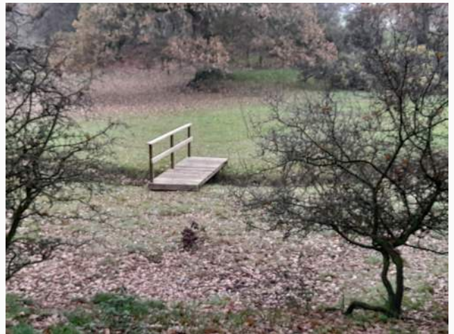
crossing point over tidal channel towards Airds Point (New Abbey)