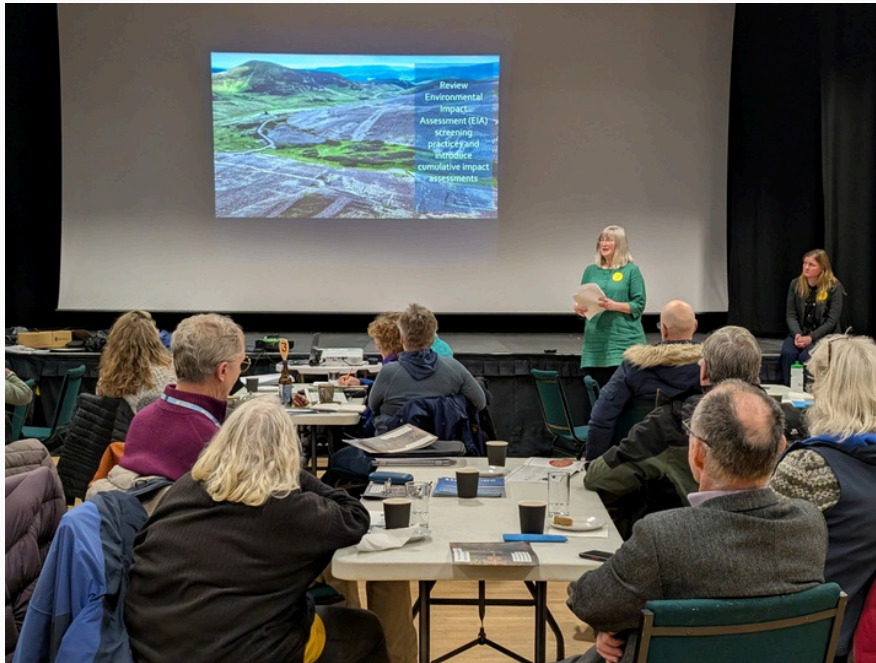
Launch event Langholm

Regular readers will be aware that we facilitate the Environmental Alliance of the South of Scotland and, together with members and partners, we held a well-attended launch event in Langholm at the end of November for an important and timely new paper, setting out the EASOS vision and recommendations for Forests and Woodlands in the South of Scotland.