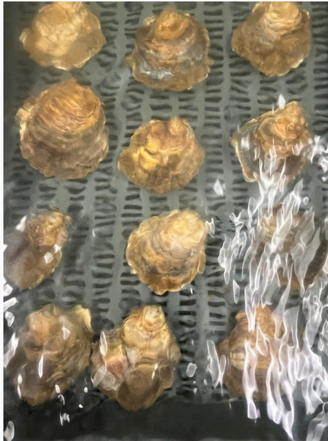
Loch Ryan Oysters at SAMS

Alongside Dumfries & Galloway Council, Solway Firth Partnership and many other partners, we are proud to be part of the exciting Solway Coast and Marine Project (SCAMP) Landscape Connections project, funded by the Heritage Lottery Fund, and now in its development phase.