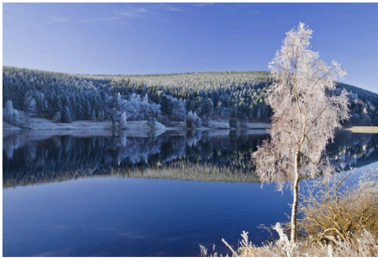
Hoar frost, Scottish Borders

Hello and welcome to our December newsletter!