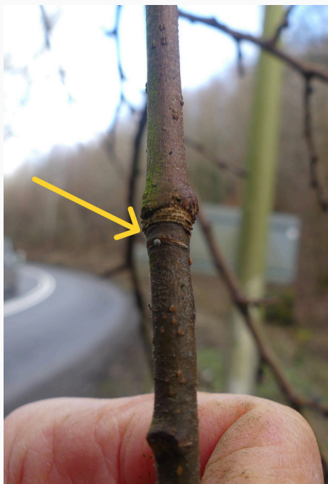
White-letter hairstreak egg (annotated)