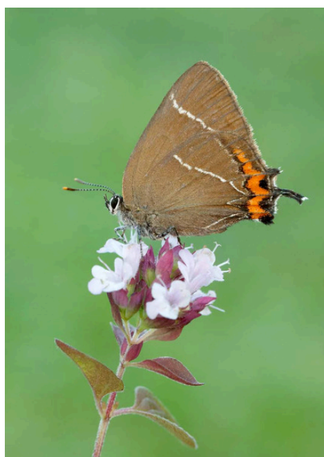
White-letter Hairstreak

Hello and welcome to our first newsletter of 2026!