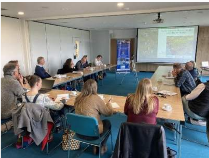
Hybrid Dumfries meeting held at Dumfries Baptist Church on 31st March

This year, SUP has taken on a greater role in the Environmental Alliance for the South of Scotland (EASoS) , an alliance of environmental experts and organisations from across the South of Scotland whose members have been brought together to facilitate our collective environmental ambitions and actions for the region.