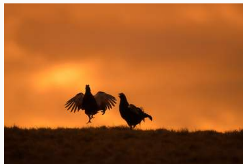
taken in the Moorfoot Hills