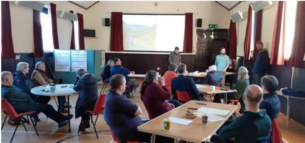
Mapping natural Capital in Tweedsmuir

GIS mapping - Community workshops have been run in Tweedsmuir and Ettrickbridge as part of the natural capital GIS mapping report being researched and written by a team from the Wild Land Research Institute and Leeds University. The completed report will be available by the end of June.