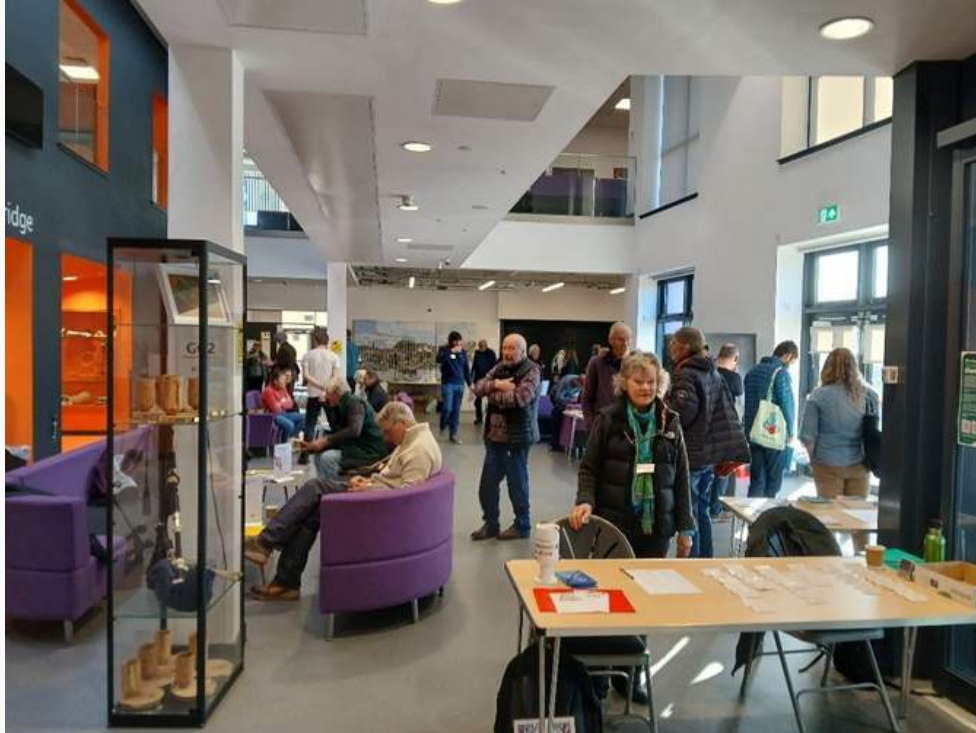
Delegates @ Dumfries Recorders' Gathering March 2025

Our South West Scotland Environmental Information Centre (SWSEIC) team were delighted to welcome 80 people to the first of two south west wildlife recorders' gatherings at The Bridge in Dumfries earlier this month. Fascinating talks from Scottish Badgers, RSPB and the Botanical Society of Britain & Ireland were all very well received, as was the opportunity to mingle, browse the stalls and join the afternoon workshop or guided walk.