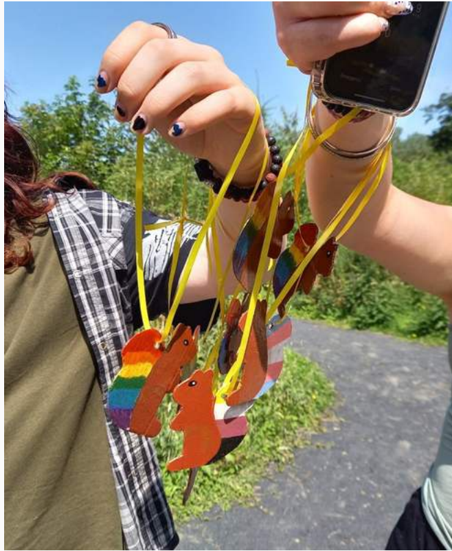
LGBT Youth Borders

Our Scottish Borders Climate Action Network (SBCAN) team have been doing an amazing job to engage young people in understanding climate change and taking action and we wanted to highlight some of it this month.