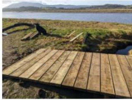
Work happening on the Core path at Glencaple