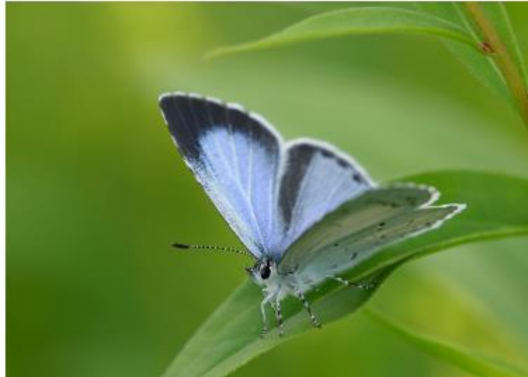
Holly Blue Butterfly

With the main period for events and activities behind us, SWSEIC staff can look back on a very busy summer (or what approximated to a summer) in 2024.