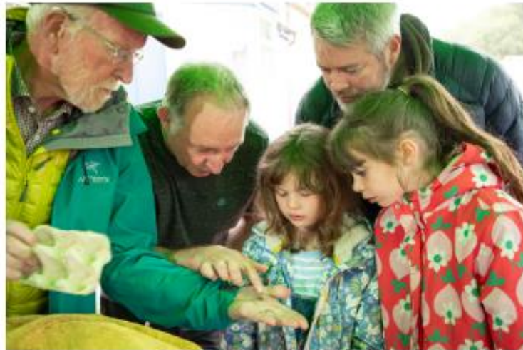
Community moth trapping in Corsock