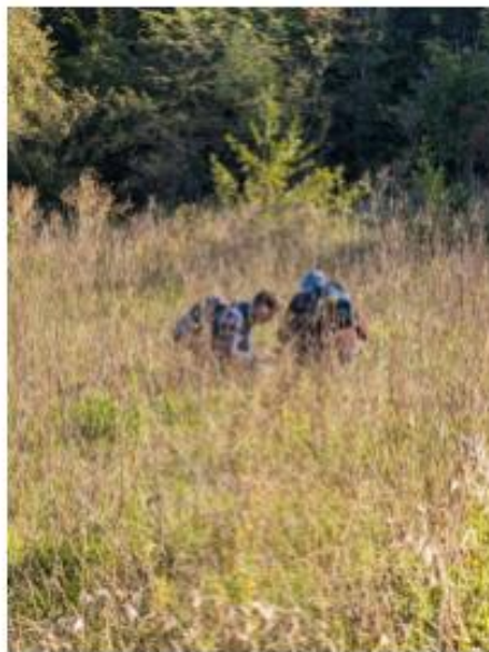
Surveying invertebrates at Hannahston Community Woodland

A common thread from our wildlife recording volunteers this year has been "where are the butterflies?". Many of the common species that we usually encounter – such as Peacock, Small Tortoiseshell and Red Admirals – have been in short supply, and Butterfly Conservation's Big Butterfly Count confirmed that the picture was repeated throughout the UK ( https://butterfly-conservation.org/news-and-blog/uk-butterfly-emergency-declared ). Thankfully some local species, such as Speckled Wood and Holly Blue, have continued to do well in south west Scotland and have been reported locally in record numbers.