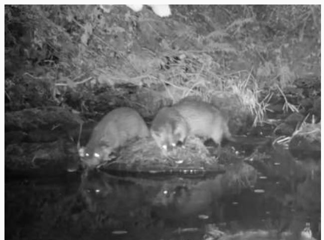
Two young otters

To date, at least six bat species have been detected, along with most of the other small mammals including Water Shrews at two sites. Larger species have included Hedgehogs, Rabbits, Brown Hares, Red Squirrels, Foxes, Badgers and Roe Deer. A number of non-native species have been recorded, including American Mink and Grey Squirrels, but the project has also successfully collected video evidence of some of our less commonly seen native mammals, including Pine Marten and, most recently, some great footage of two young Otters - see here: www.youtube.com/watch?v=dv2r6oEtCEQ .