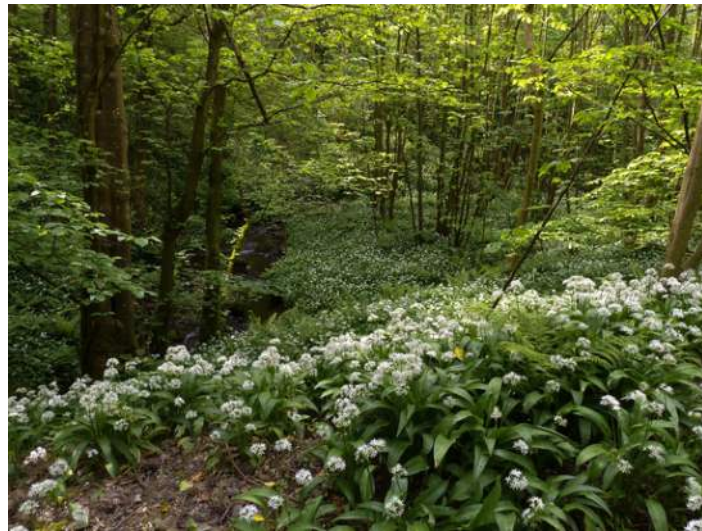
Ramson woodland

Hello and welcome to our Spring newsletter!